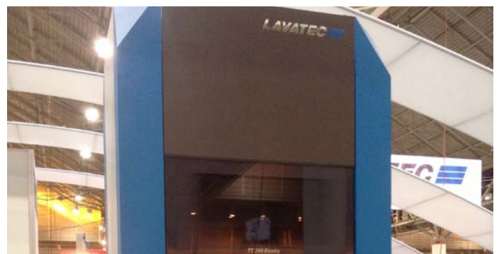
No one in the convention center could miss seeing the new TT EcoDry 745.