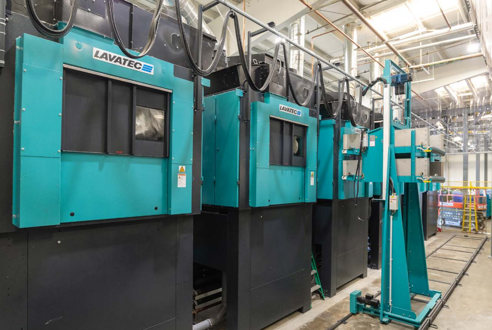
Campus Laundry is experiencing savings and reduced drying times with the addition of LAVATEC's TT dryers.